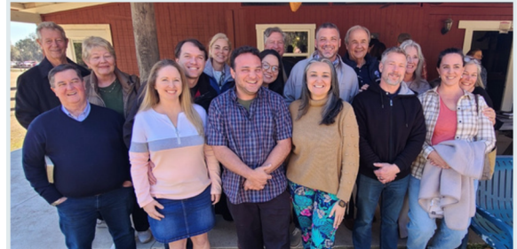
GM365 Board of Directors